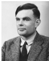
Alan Turing 1912–1954